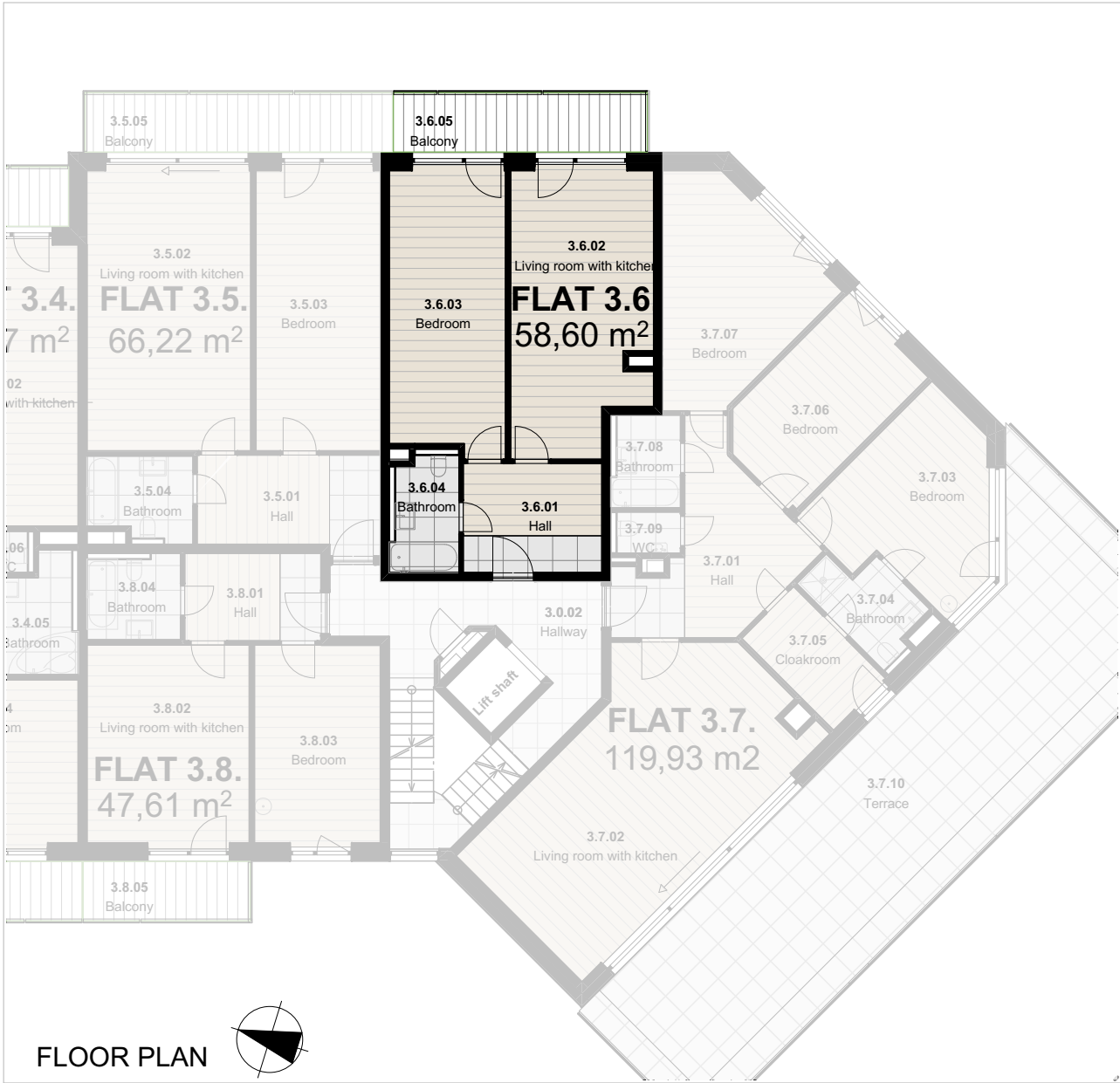
SITE PLAN - FLAT LOCATION